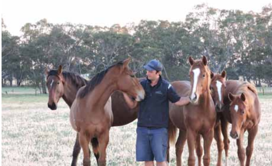
Yearling colts destined for the March 2016 Melbourne Premier Yearling Sale. They are a mixture of homebred progeny, born and raised at Stonehouse Thoroughbreds, and 'pinhooks' which are purchased as weanlings and grown out to be sold at the yearling sales.

A year at Marcus Oldham provided me with the business skills and connections that has paved the way for me into this industry. On completion of the course I knew I needed international experience and with this industry being