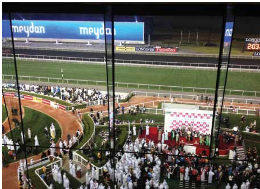
Meydan Racetrack – Dubai World Cup